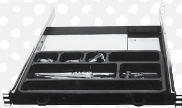
DR-1 1U Pullout Drawer with Pencil Insert