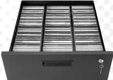
DR-4 with CD-4 4U Pullout Drawer with 3 CD Holders (up to 90 CDs)

KAE Corporation offers the broadcast engineer two versions of pullout work surfaces. Both units occupy 1 rack unit (1.75") of space. The Pullout Shelf is a metal shelf/work surface that allows the customer to have a ready surface to work on that is easily pushed back into the rack. The Pullout Laminate Work Surface provides a quality work area for the customer. This unit has an attractive laminated 3/4" furniture grade surface. Both units provide an ideal workspace that when fully extended is 16". The rack slides have a positive lock out when fully extended. The capacity of each unit is 50 pounds when fully extended. Also, both units fit all 19" EIA racks from 23-30" deep.