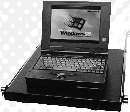
POS-1 1U Rack Mount Pullout Shelf with PC Notebook