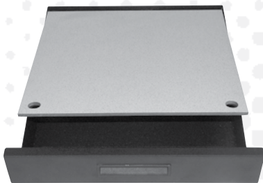
DR-2T 2U Utility Drawer with Flip Up Laminated Work Surface