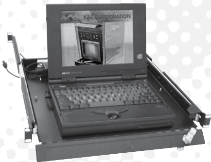
NB-1 1U Pullout Notebook Drawer with Flip Down Front Panel and Cam Lock