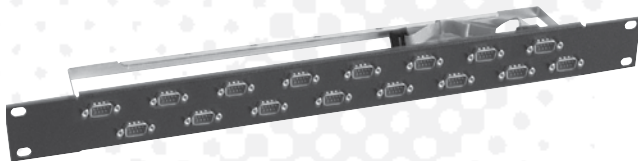
BOP-5 1U Breakout Panel, 16 9-pin D, Rear Cable Relief Bar

To facilitate cabling connections for flight cases, trucks and other applications for remote shoots, KAE Corporation has developed several versions of breakout panels. All breakout panels include all connectors fitted. The BOP-1 (1U) has 6 BNC female to female connectors for video and 12 XLR connectors for stereo audio. The BOP-2 (1U) has 16 XLR connectors. The BOP-3 (1U) has 16 BNC female to female connectors. The BOP-4, a 2U breakout panel with cable relief bar has 24 XLR Audio connectors. The XLR connectors can be either male or female, please specify when ordering.