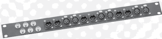
BOP-1 1U Breakout Panel, 6 BNC+12 XLR